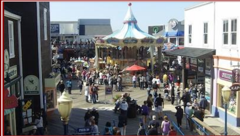
Pier 39 in San Francisco Food and Fun!